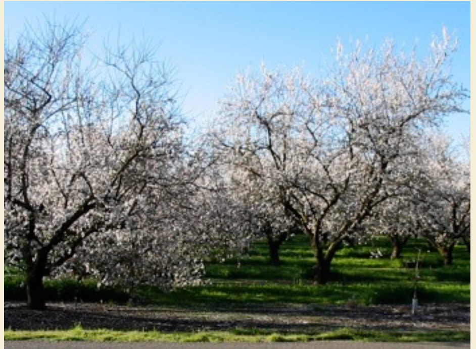
Wood Colony almond orchard on Woodland Avenue, east of Dakota.

I was unable to convince the Council I served with to make the change. But I never dreamed that a future Council would be even more outrageous and add Wood Colony to the map. The